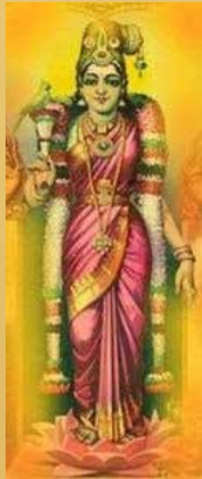
A. Devī Minākṣi

Kailāsonnata Śyāmala Pīṭha Sarvajnapīṭham's rare and sacred lineage of Pontiffs has been systematically carried over in an unbroken progression from ages. The chosen emissaries of Lord Paramasīva and Devī, the Gurū Mahā Sannidhānams (pontiffs) of Kailāsonnata Śyāmala Pīṭha Sarvajnapīṭham are the direct representatives of the cosmos: