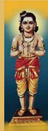
C. Tiru Jnānasambandar