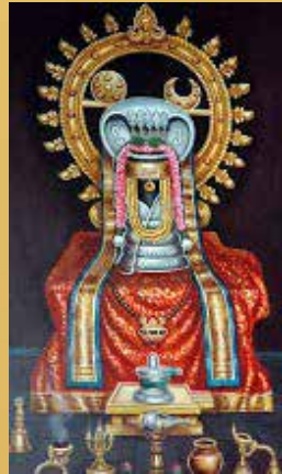
B. Lord Sundareśvara