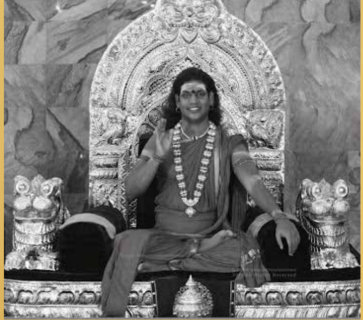
I. 293rd Gurū Mahā Sannidhānam of Kailāsonnata Śyāmala Pīṭha Sarvajnapīṭham Bhagavān Sri La Sri Nithyānanda Paramaśiva Sri Jnānasambanda Desika Paramāchārya Swāmigal