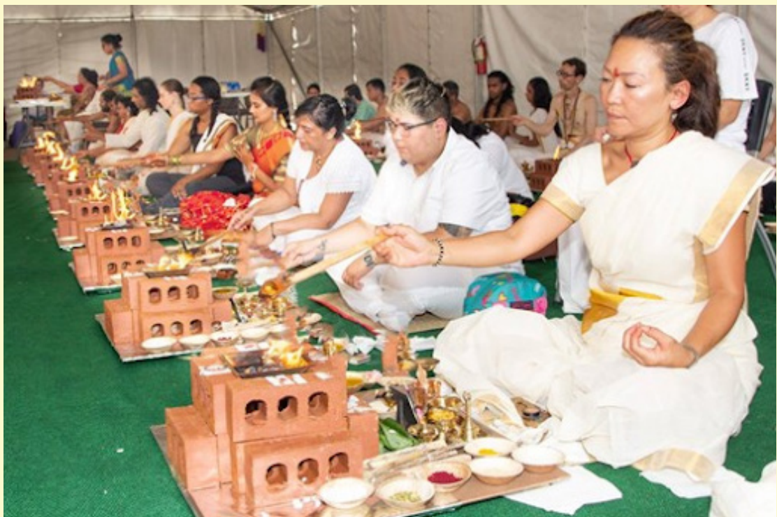
Vedic rituals conducted to bring peace and conscious sovereignty