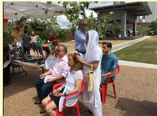
The trained religious peacekeepers of the Nithyanandeśvara Paramaśiva Hindu Temple, Houston conducting spiritual healing sessions to promote the science of healing and to produce, provide the necessary services to the citizens of Texas.