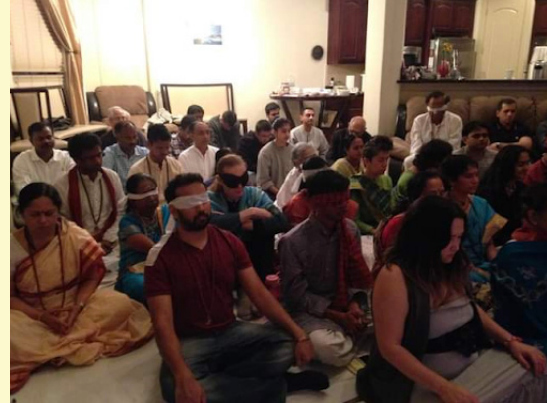
Trained religious peacekeepers conducting meditation programs in the Nithyanandeśvara Paramaśiva Hindu Temple, KAILASA Houston to uplift the spiritual values and the physical, mental and psychological well-being of the citizens of Texas.